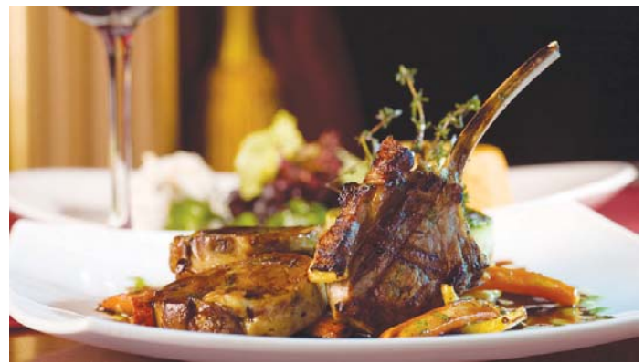
Eating out is a pleasurable experience in the West Highlands

3 COURSE SPECIAL FOR £12 AVAILABLE LUNCH AND EARLY EVENING